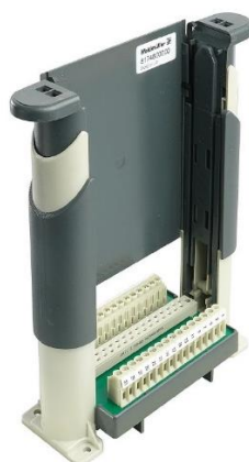
Example photo of initial situation for article 8174800000

The articles on Section 5 were delivered in the past with their structural frame in color Grey RAL 7032 (light grey component from the photo below).