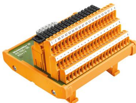
Representative RS IO Interface (w/ LPK SI and LPK3)